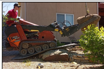
Mini Skids (left) require a minimum of 43" access.

EMAIL pictures of your invoice and your planting site showing access from the street to you planting site to: trees@FrontRangePlanting.com